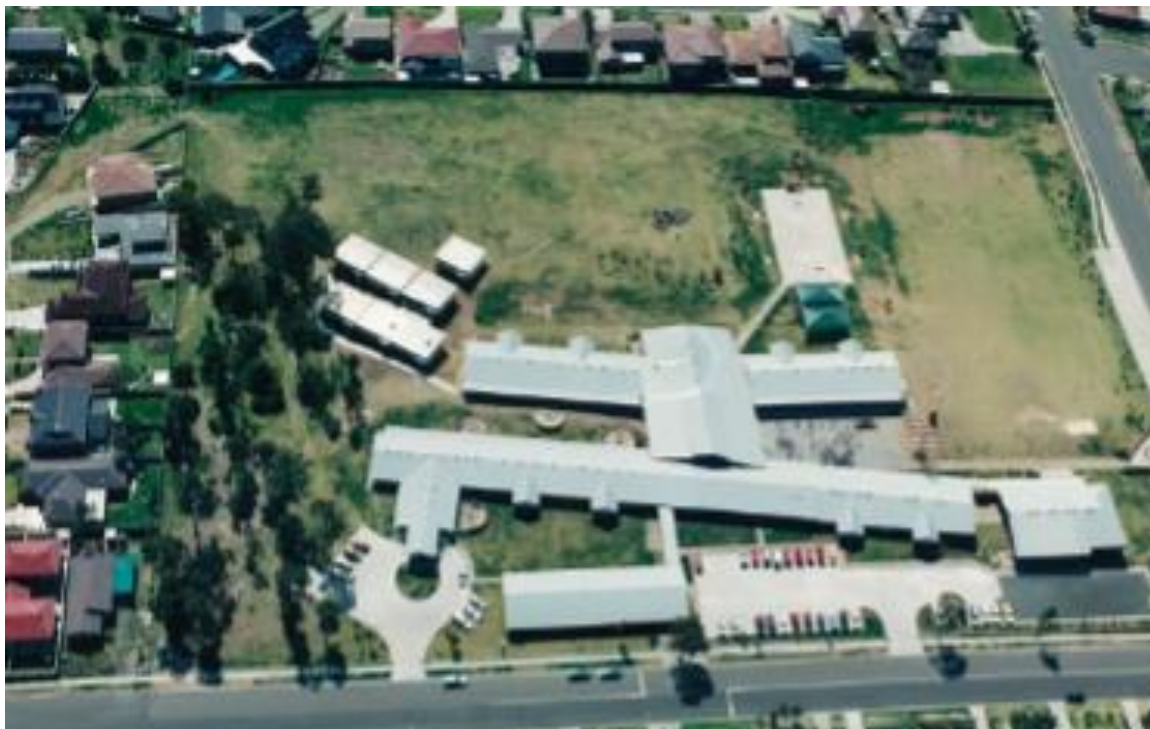
1996 aerial view of our school grounds