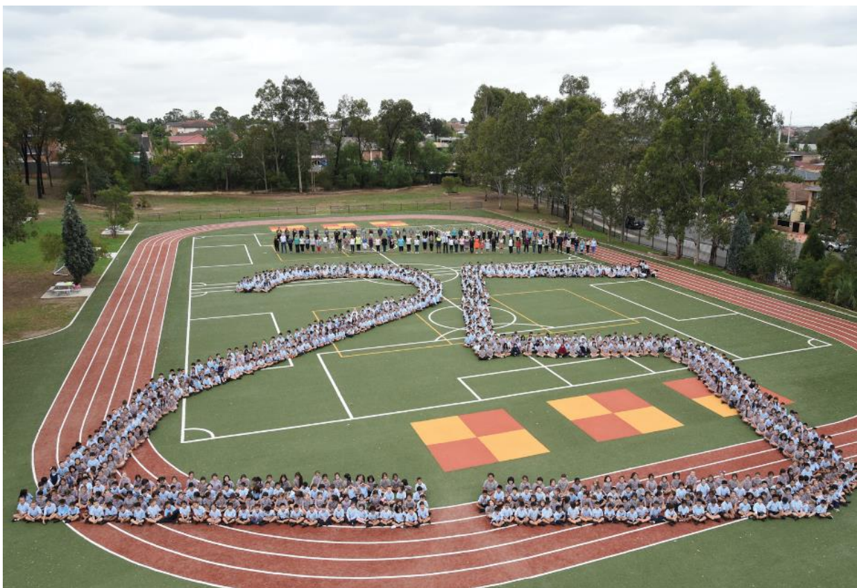
3 rd April, 2018

We have planned a number of exciting activities and opportunities for staff, students and community members of the Bonnyrigg Heights Primary School family. We hope that all our students, families, staff and community members - both past and present - are able to join us in celebrating our amazing school.