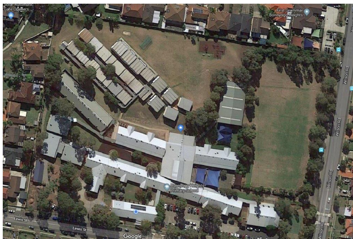
2017 aerial view of our school grounds